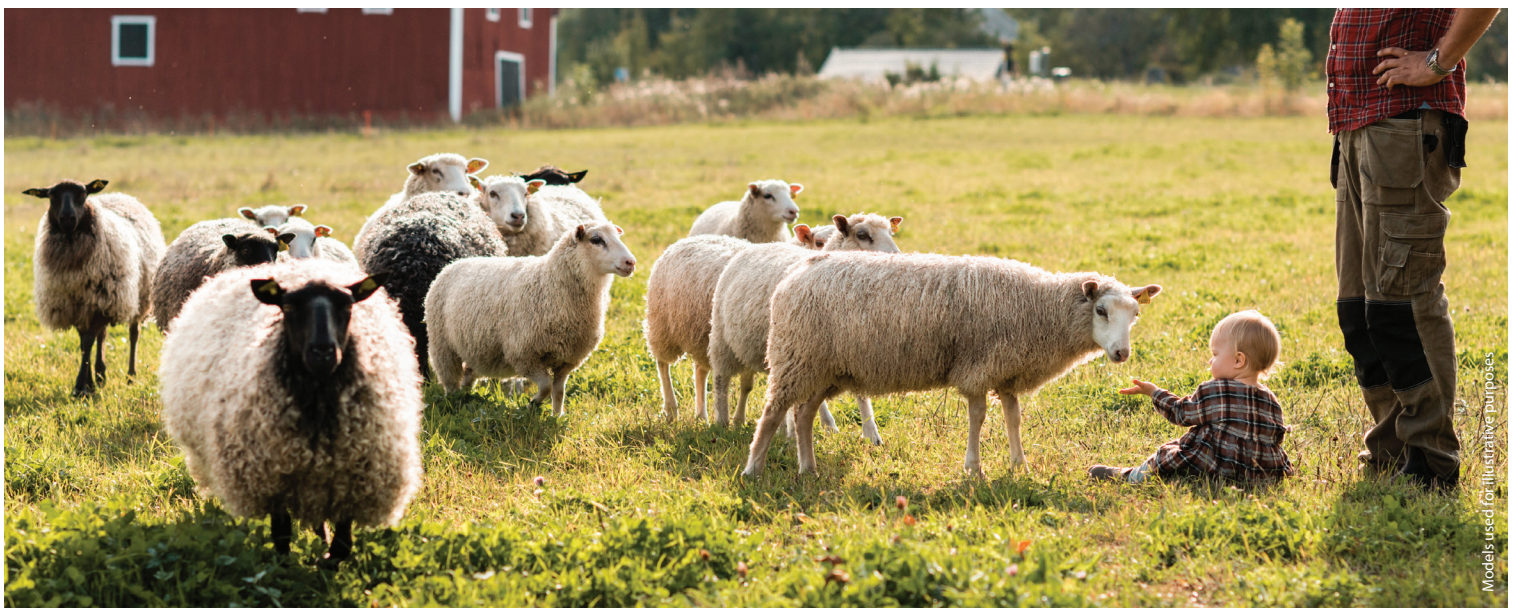
Models used for illustrative purposes.

6 All that is made is the work of God, and all is good.