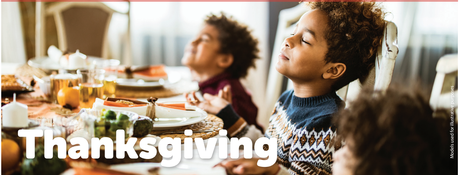
Models used for illustrative purposes